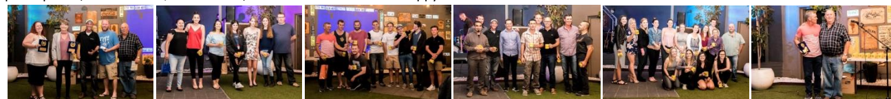
Annual Club Awards 2017

JUNIOR - Held Sat 9th September at Icely Park. This year hosted 14 teams, from U9's to U16Girls. All teams had great patronage. Again, a problem with trophies, a weakness in the trophy saw at least half a dozen or more breaking on the day, needing to be fixed. The kids had a slingshot, a gladiator, and a jumping castle for the younger ones, fairy floss, sausage sizzle and face painting. Young and old enjoying all this entertainment. Thanks to all helpers esp committee. SENIOR: Once again the Clarendon hotel for our very casual senior presentation. Finger food, cob dips, mini desserts for $10 entry fee. This year we tried something a little different with a bush band and a 50th anniversary mug instead of trophies. Some negative feedback, interesting what people think they are entitled to for participation, and how far $10 stretches, however some are never happy no matter what we do.