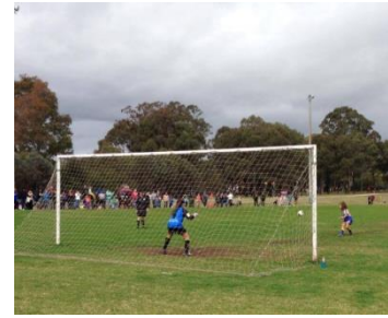
12G2 penalty shootout