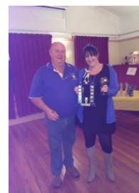
Snr Goal Keeper AAW6